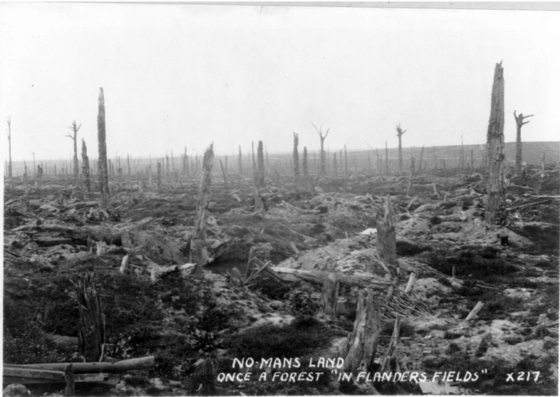
NO-MANS LAND ONCE A FOREST "IN FLANDERS FIELDS" X217