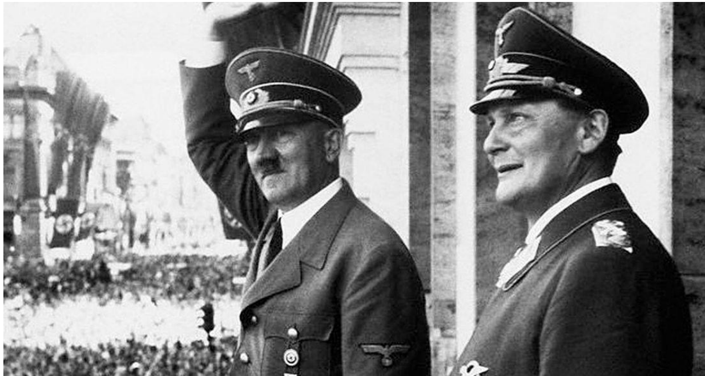
Hitler and Göring